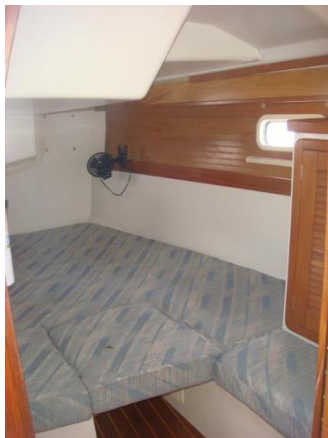
42' Catalina port guest stateroom