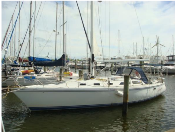
42' Catalina port forward profile