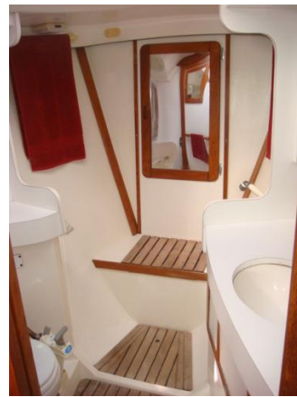
42' Catalina master stateroom head