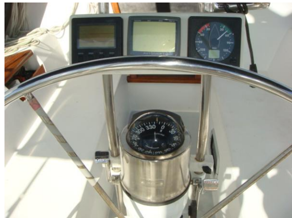
42' Catalina cockpit helm