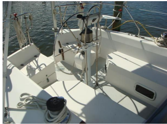
42' Catalina cockpit