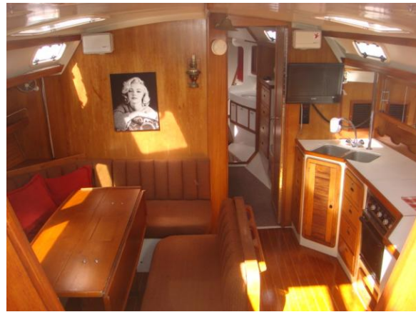
42' Catalina salon forward