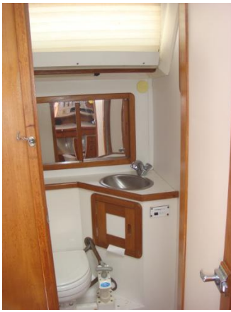
42' Catalina guest head