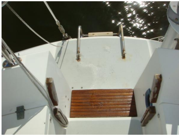
42' Catalina swimplatform