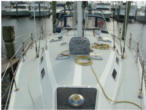
42' Catalina foredeck aft