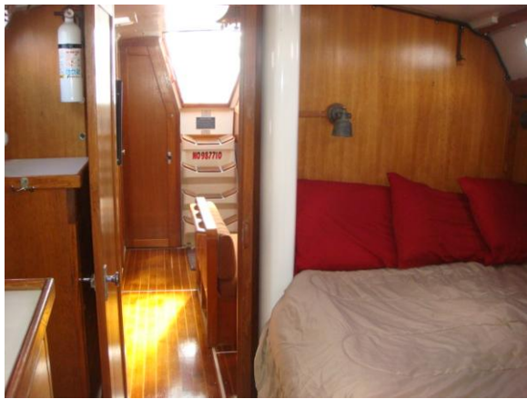
42' Catalina master stateroom aft