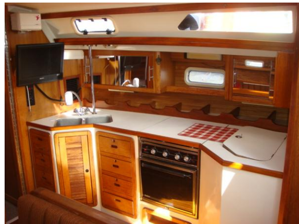
42' Catalina galley photo1