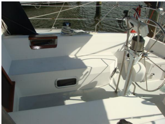
42' Catalina cockpit starboard