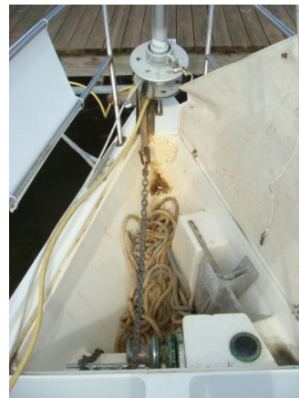
42' Catalina anchor windlass