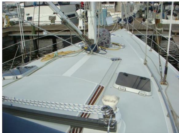
42' Catalina foredeck