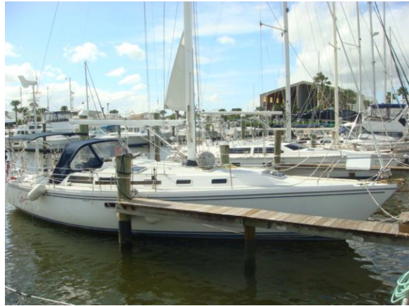
42' Catalina starboard forward profile