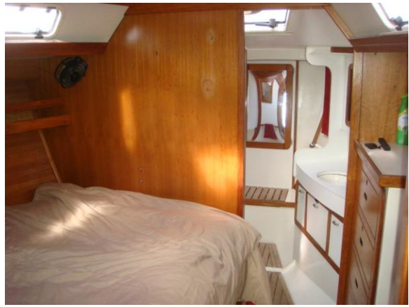
42' Catalina master stateroom forward