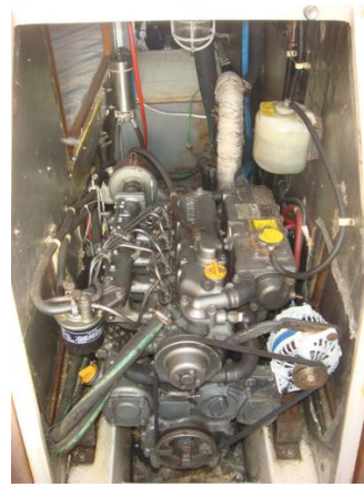
42' Catalina auxilliary