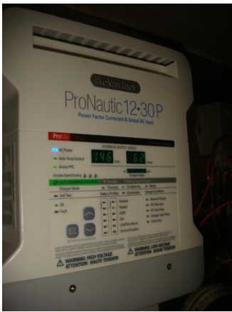
42' Catalina battery charger