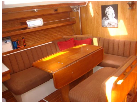
42' Catalina salon seating