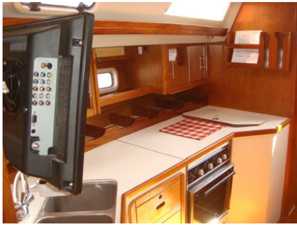
42' Catalina galley photo2