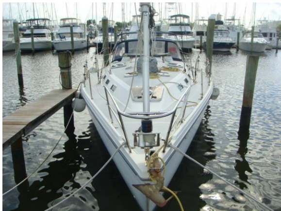
42' Catalina forward profile