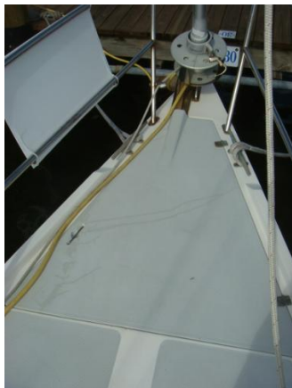
42' Catalina anchor windlass covered