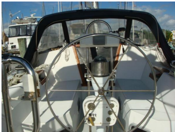
42' Catalina cockpit forward