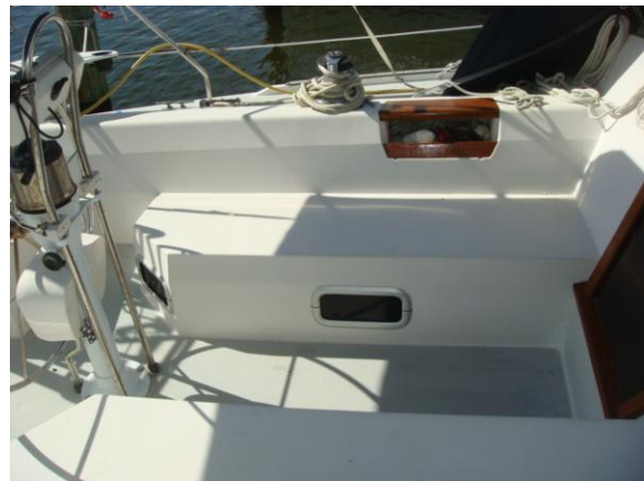
42' Catalina cockpit port