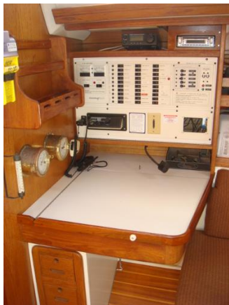
42' Catalina nav station