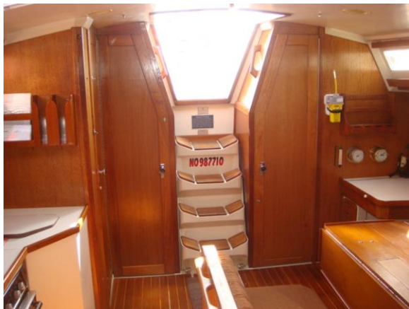
42' Catalina salon aft