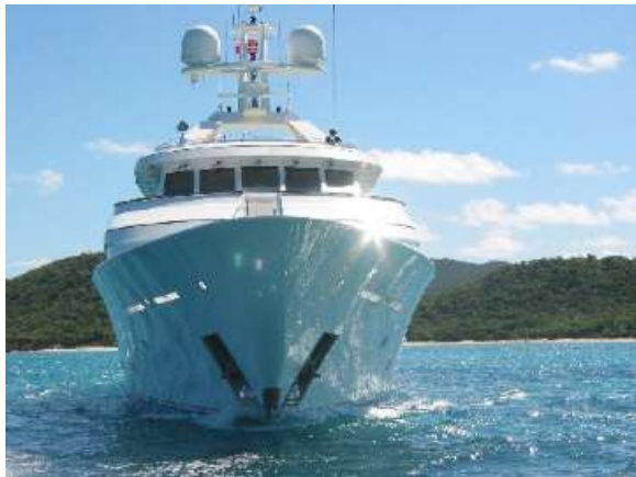
153' Feadship stbd profile