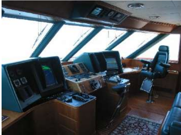
153' Feadship Wheelhouse console