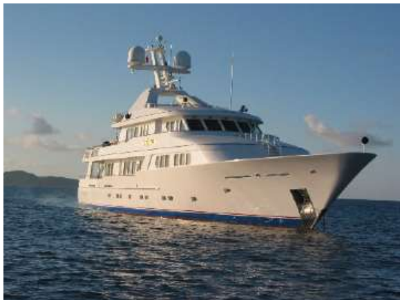
153' Feadship stbd fwd profile2