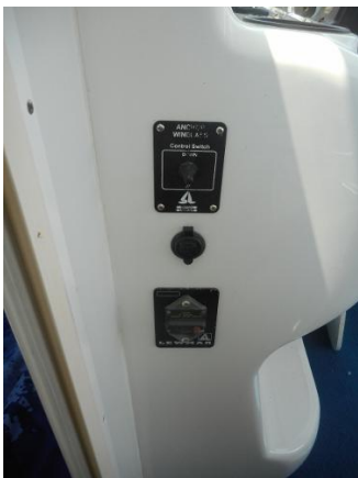
Glacier Bay 2685 Coastal Runner Windlass remote