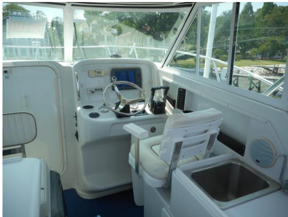
Glacier Bay 2685 Coastal Runner Helm area