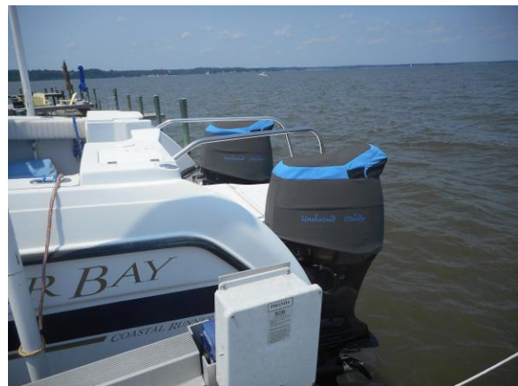
Glacier Bay 2685 Coastal Runner Engine covers