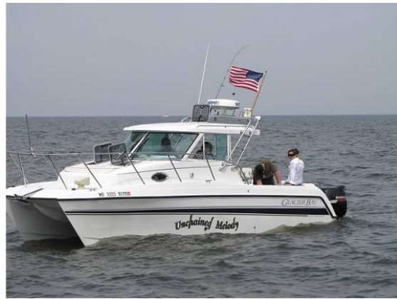
Glacier Bay 2685 Coastal Runner Profile