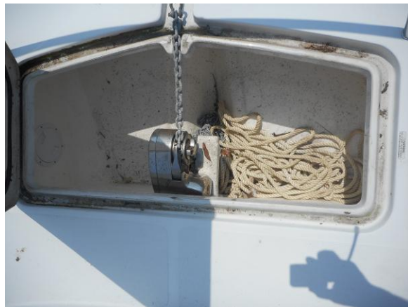
Glacier Bay 2685 Coastal Runner Anchor locker