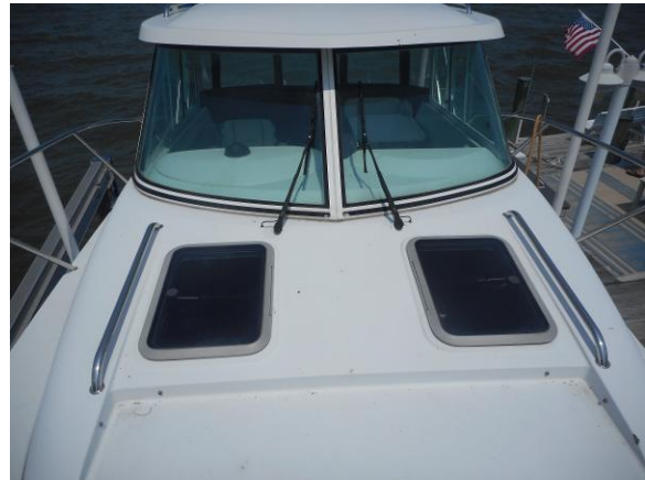
Glacier Bay 2685 Coastal Runner Bow area