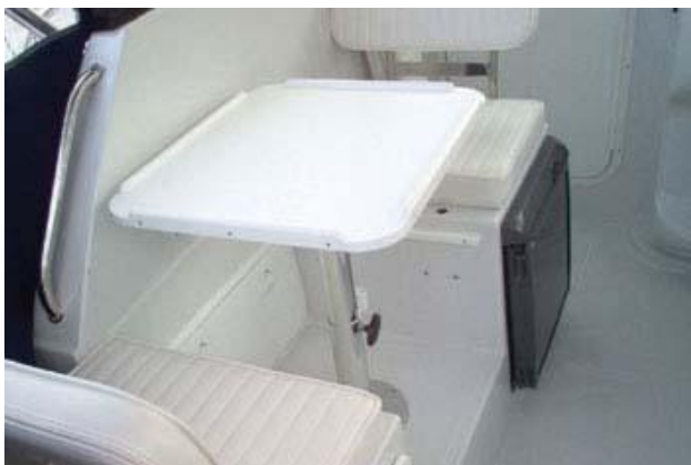
Glacier Bay 2685 Coastal Runner Dinette and Sleeper