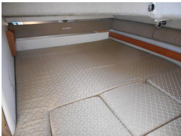
Glacier Bay 2685 Coastal Runner Berth forward