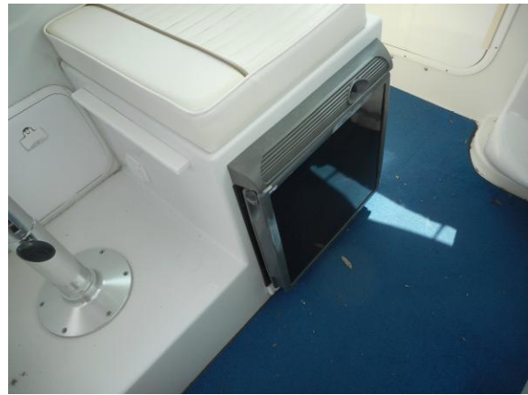
Glacier Bay 2685 Coastal Runner Refrigerator