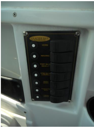
Glacier Bay 2685 Coastal Runner DC Panel