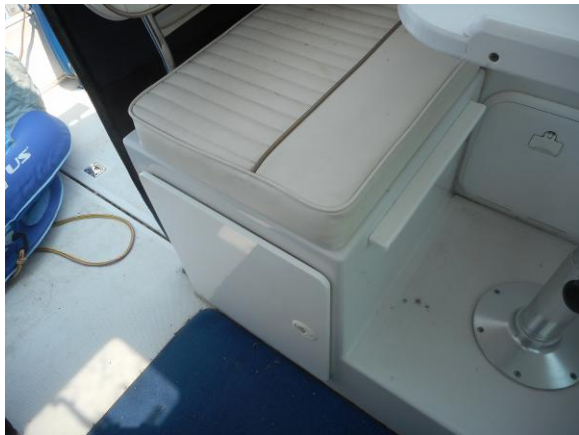
Glacier Bay 2685 Coastal Runner Dinette storage