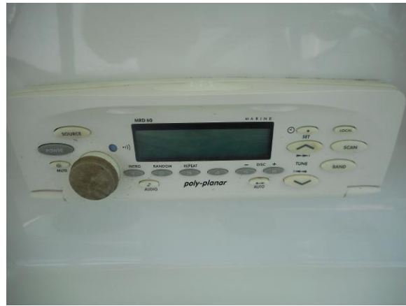
Glacier Bay 2685 Coastal Runner Poly Planar