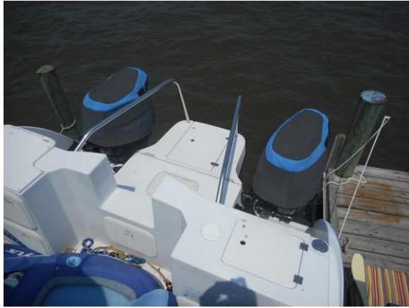
Glacier Bay 2685 Coastal Runner Transom