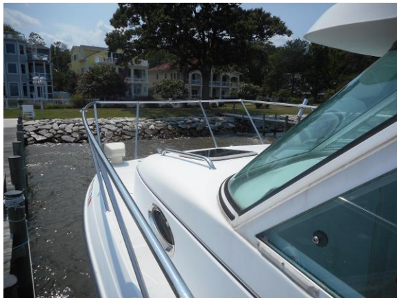
Glacier Bay 2685 Coastal Runner Port bow