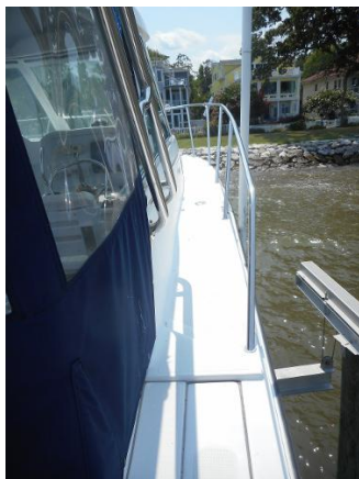
Glacier Bay 2685 Coastal Runner Starboard gunwal