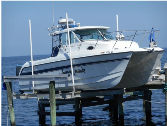
Glacier Bay 2685 Coastal Runner Profile