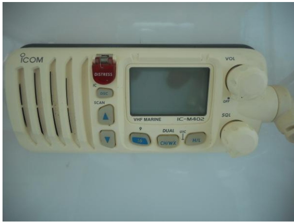
Glacier Bay 2685 Coastal Runner ICOM VHF