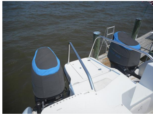
Glacier Bay 2685 Coastal Runner Swim platform, rails and ladder