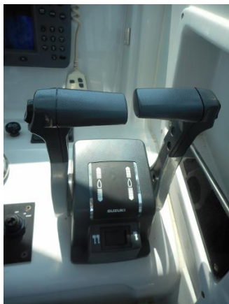
Glacier Bay 2685 Coastal Runner Throttles and clutches