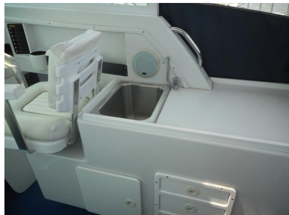
Glacier Bay 2685 Coastal Runner Wet bar and prep area