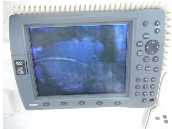
Glacier Bay 2685 Coastal Runner Garmin