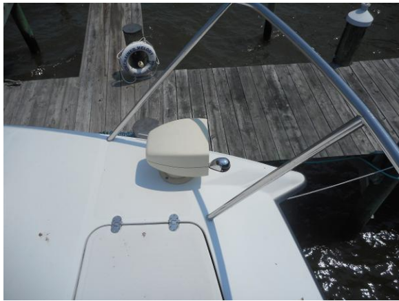
Glacier Bay 2685 Coastal Runner Remote search light