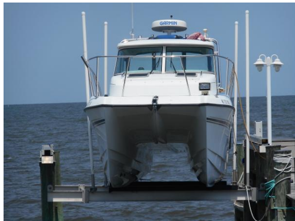
Glacier Bay 2685 Coastal Runner Lift stored