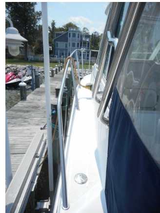
Glacier Bay 2685 Coastal Runner Port gunwal