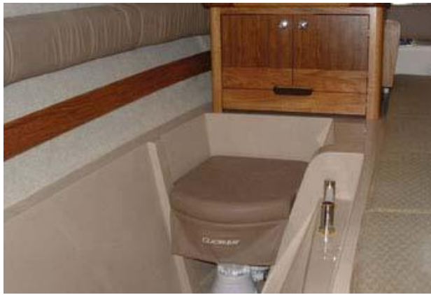
Glacier Bay 2685 Coastal Runner Head