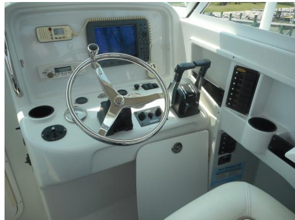
Glacier Bay 2685 Coastal Runner Helm controls