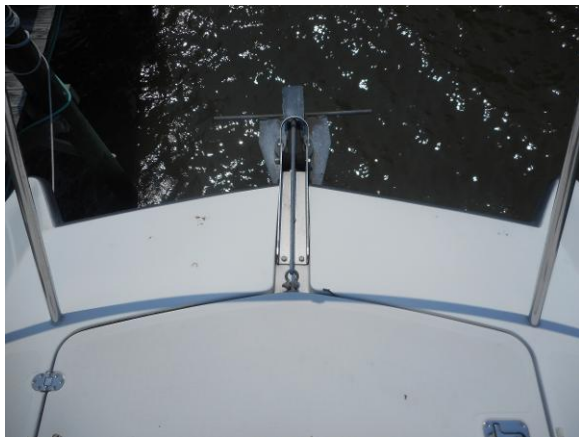
Glacier Bay 2685 Coastal Runner Anchor and roller