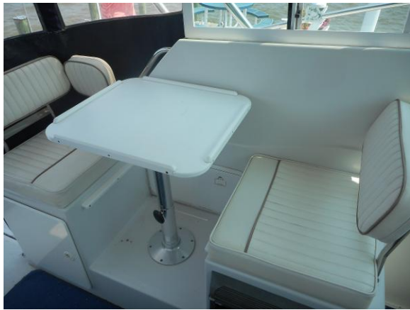
Glacier Bay 2685 Coastal Runner Dinette and Sleeper