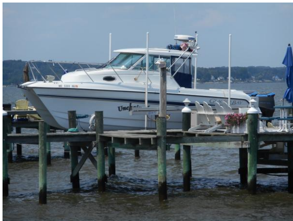
Glacier Bay 2685 Coastal Runner Lift stored