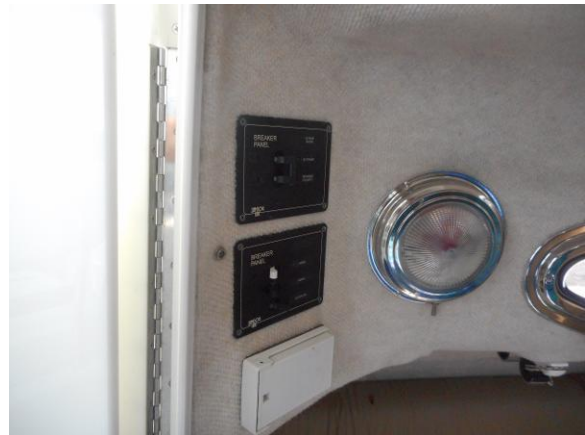
Glacier Bay 2685 Coastal Runner AC Panel