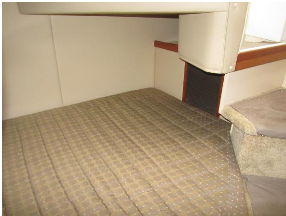
Cruiser 28' Stern Stateroom photo #2