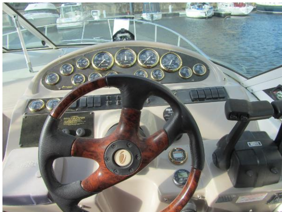
Cruiser 28' Gages & controls