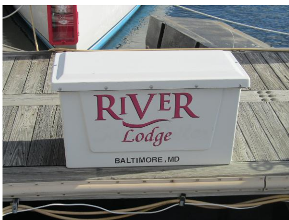
Cruiser 28' Dock box