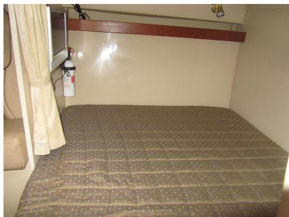
Cruiser 28' Stern stateroom photo #1