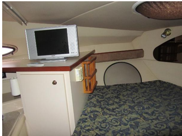
Cruiser 28 Master berth Port side