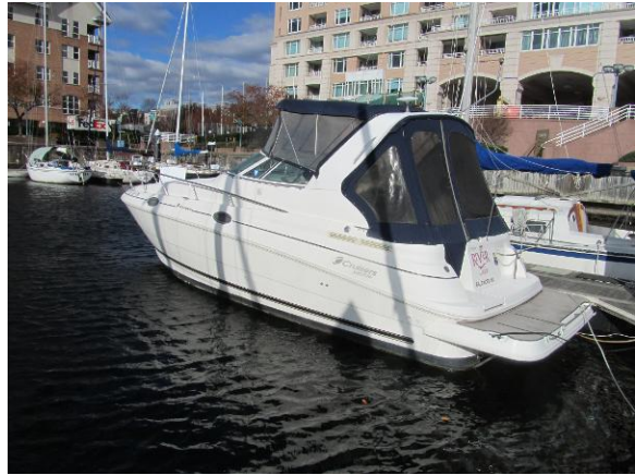
Cruiser 28' STBD Profile