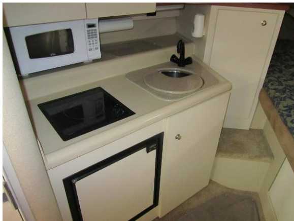
Cruiser 28' Galley area