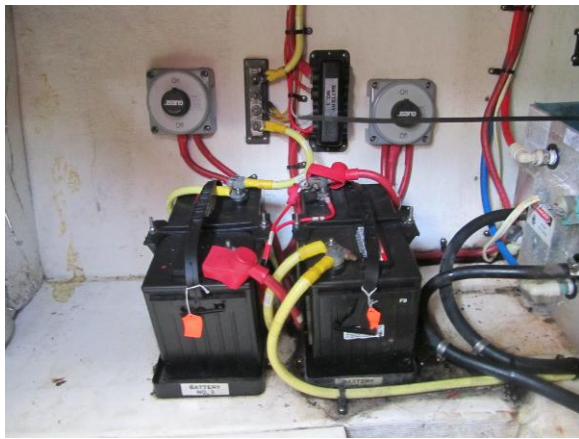
Cruiser 28' Batteries with shut off