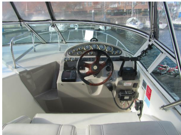
Cruiser 28' STBD helm area