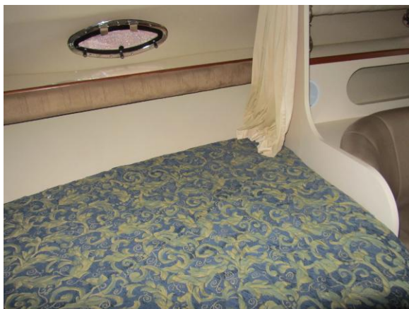
Cruiser 28 Master berth STBD side Photo #2