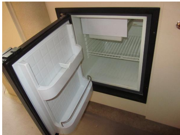
Cruiser 28' Refrigerator