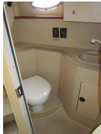
Cruiser 28' Head with shower & vanity