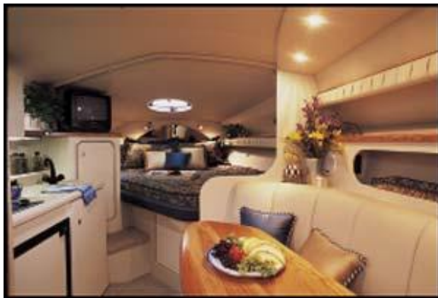
Cruiser 28' Interior