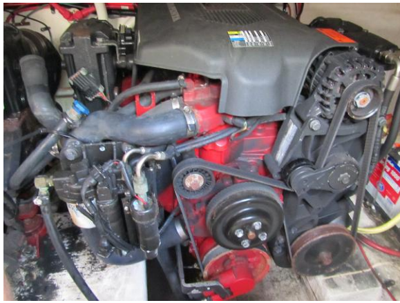
Cruiser 28' Engine room