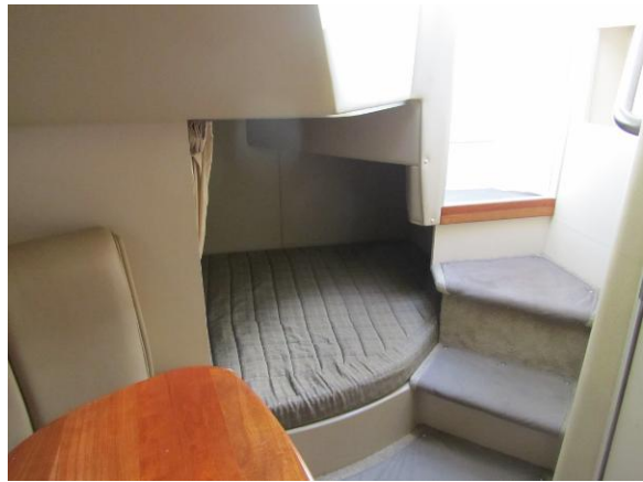
Cruiser 28' Aft cabin