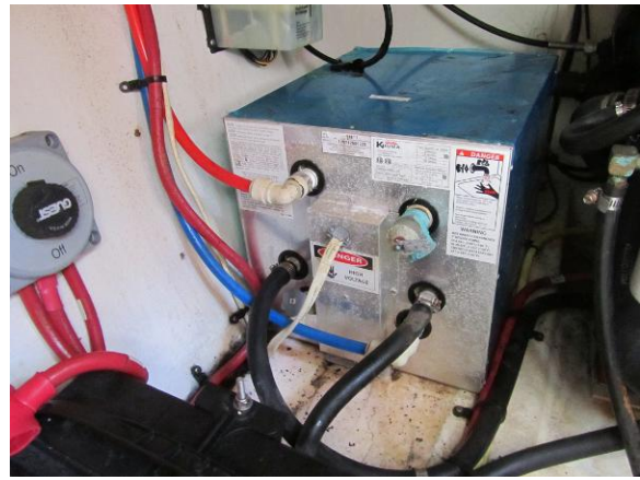
Cruiser 28' Hot water heater