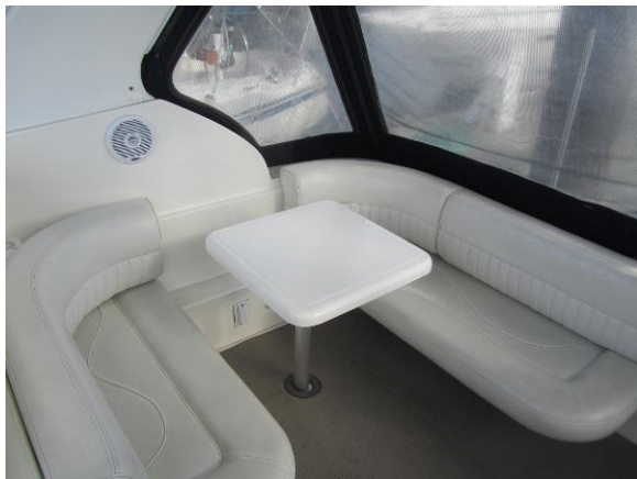
Cruiser 28' Aft Seating