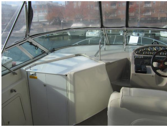
Cruiser 28' Port dash area