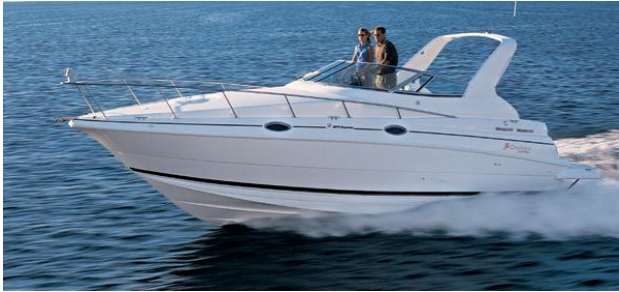
Cruiser 2870 at Cruise