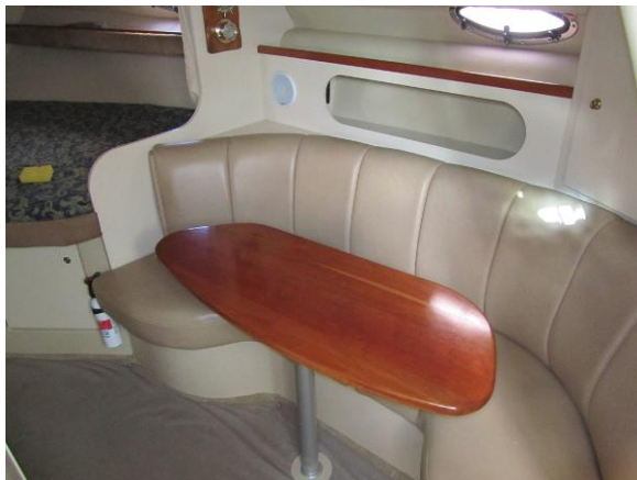
Cruiser 28' Salon settee