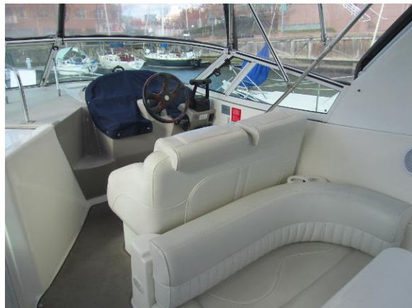
Cruiser 28' Helm double seating