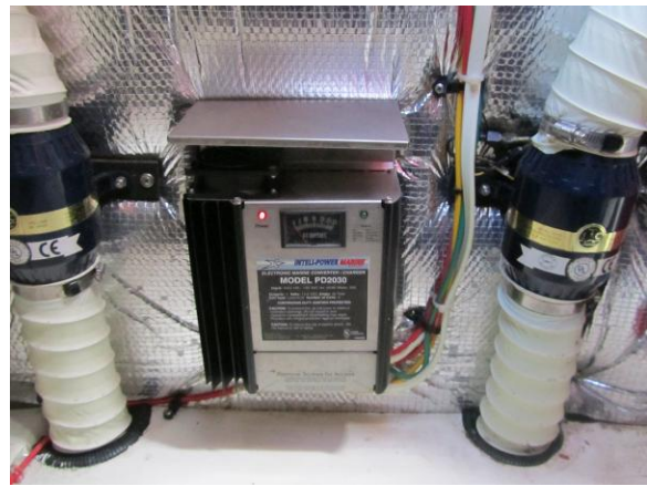
Cruiser 28' Charger