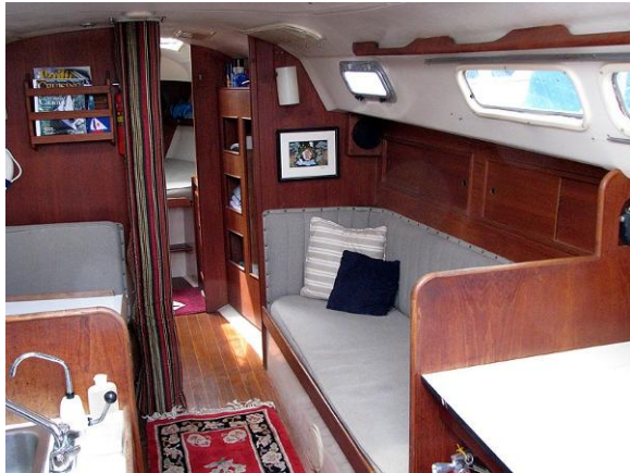
35' C&C Salon Looking Forward