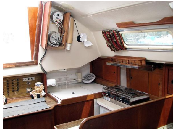
35' C&C Galley