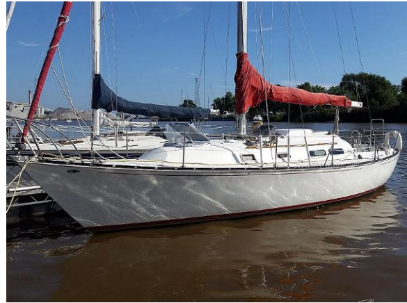
35' C&C Port Forward Profile