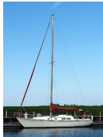
35' C&C Port Profile