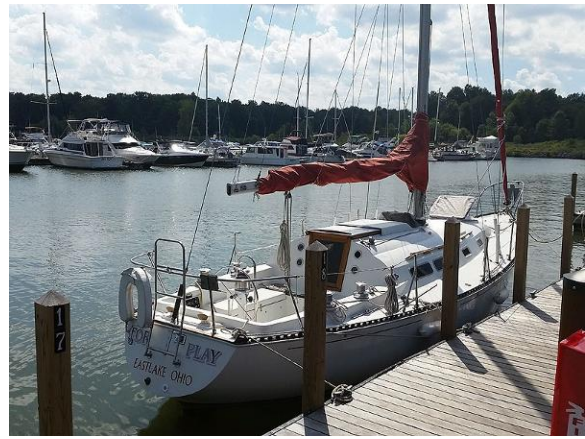
35' C&C Starboard Aft Profile