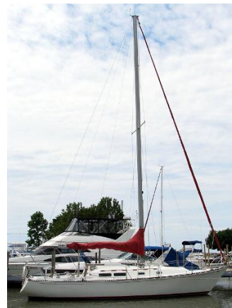
35' C&C Starboard Profile