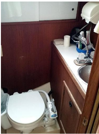
35' C&C Head