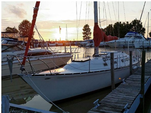
35' C&C Port Forward Profile