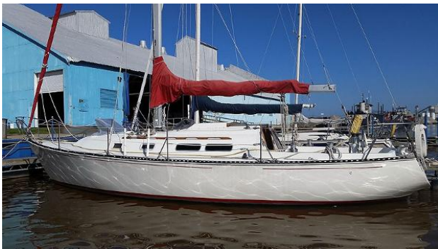
35' C&C Port Profile