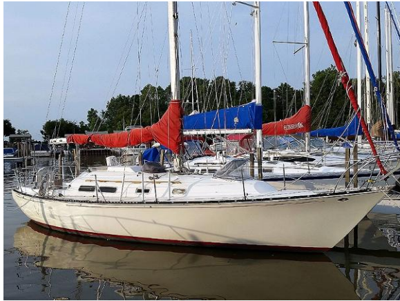
35' C&C Starboard Profile