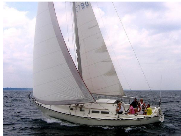
35' C&C Underway