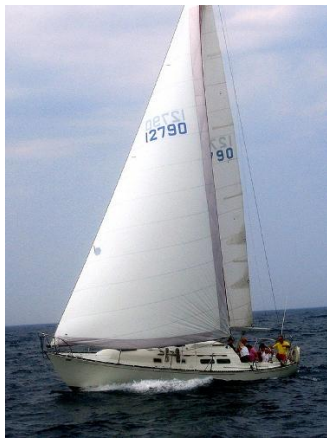
35' C&C Underway