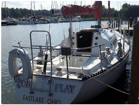
35' C&C Starboard Aft Profile