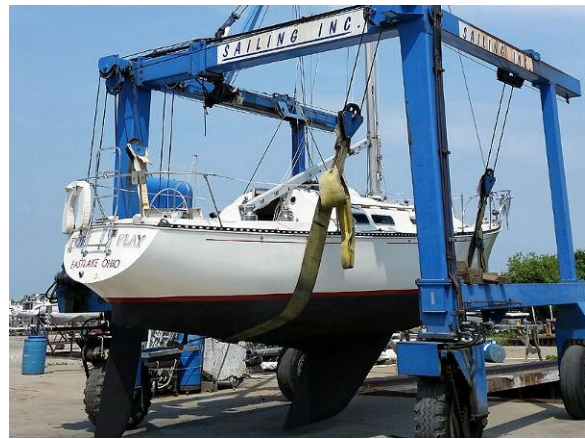
35' C&C Hauled Out