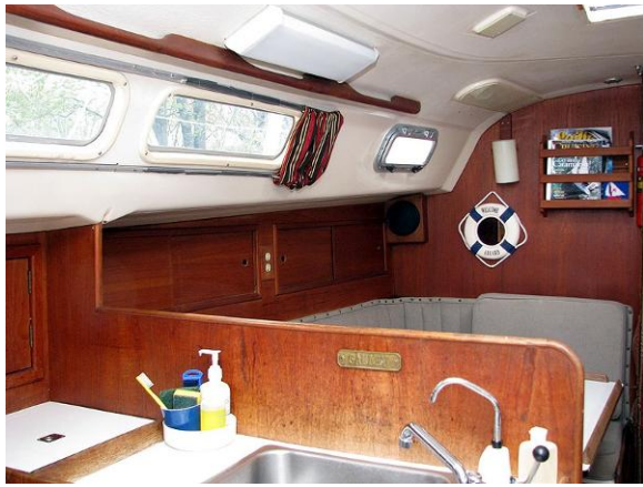
35' C&C Salon Port Side