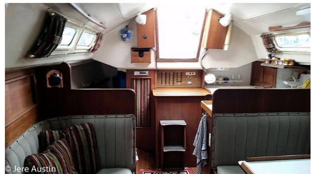
35' C&C Salon Looking Aft