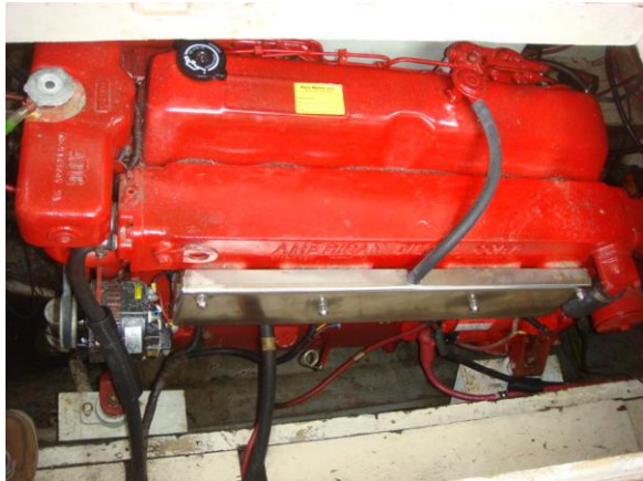
36' Albin main engine