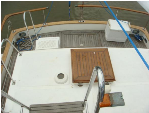
36' Albin trunk cabin