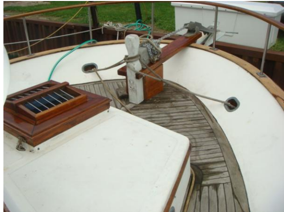
36' Albin foredeck