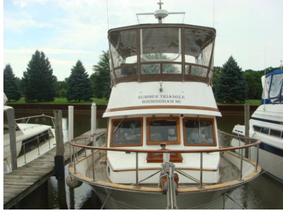
36' Albin forward profile