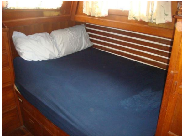
36' Albin master stateroom berth