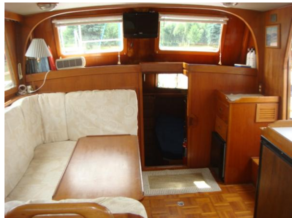
36' Albin salon aft