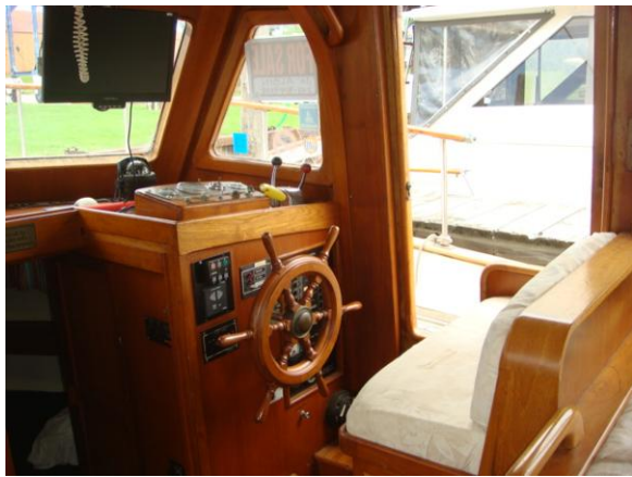
36' Albin lower helm