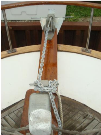
36' Albin anchor windlass