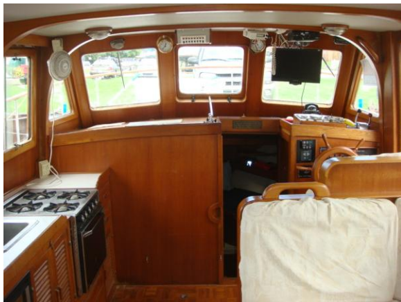
36' Albin salon forward