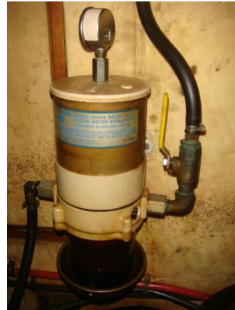
36' Albin Racor fuel filter