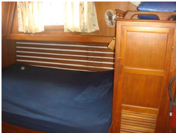
36' Albin master stateroom port