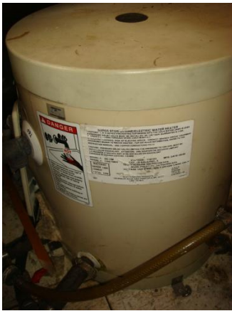
36' Albin water heater