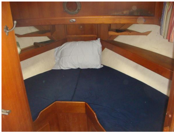
36' Albin guest stateroom