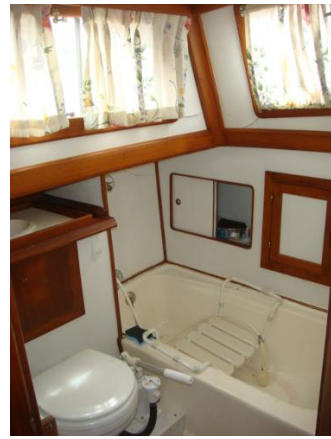
36' Albin master stateroom head