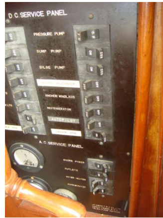
36' Albin electrical panel