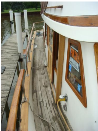
36' Albin starboard side deck photo1