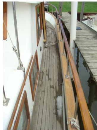
36' Albin starboard side deck photo2