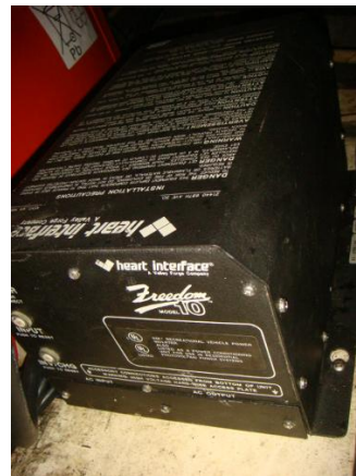
36' Albin inverter/charger