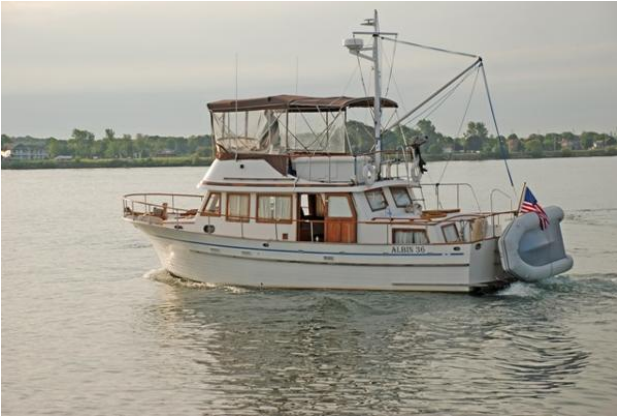
36' Albin underway port profile