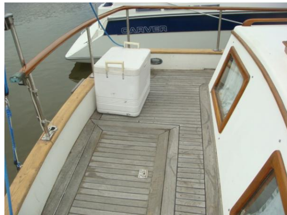
36' Albin cockpit