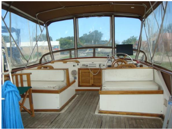
36' Albin flybridge forward