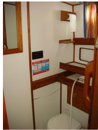
36' Albin guest stateroom head