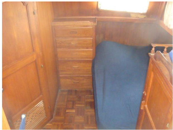
36' Albin master stateroom