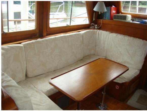
36' Albin salon settee