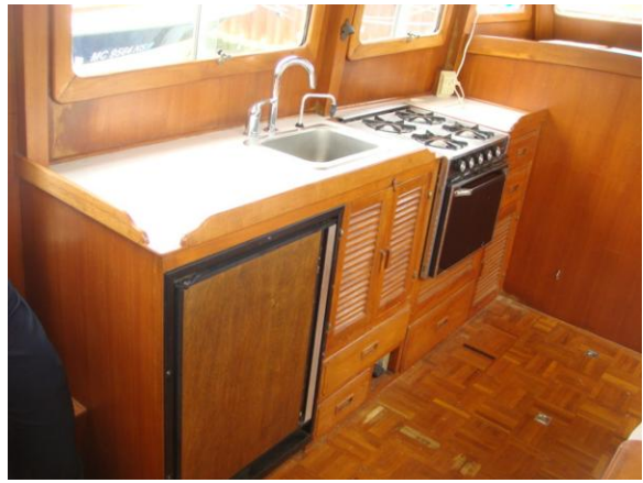
36' Albin galley