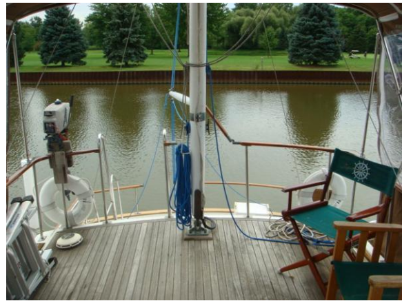
36' Albin flybridge aft