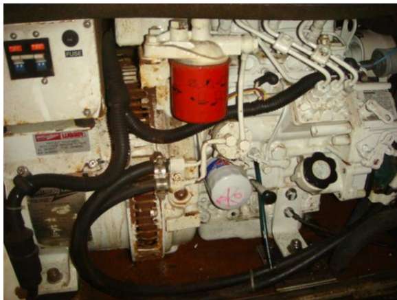
36' Albin generator