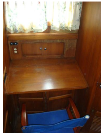
36' Albin master stateroom desk