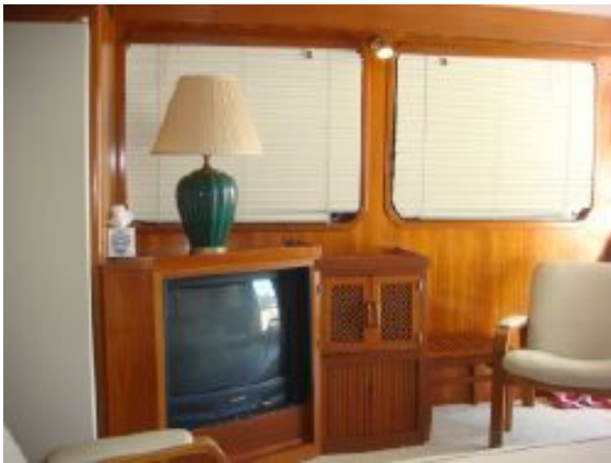
> 49' DeFever salon starboard