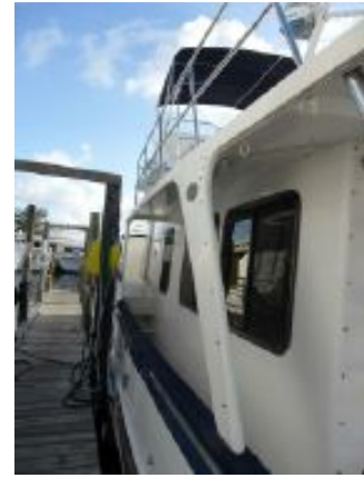
> 49' DeFever port side deck