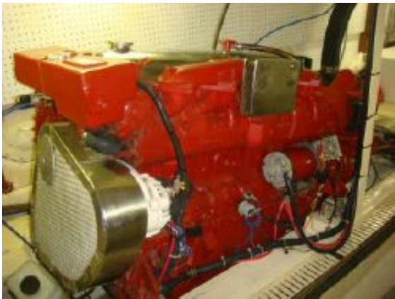
> 49' DeFever starboard main engine