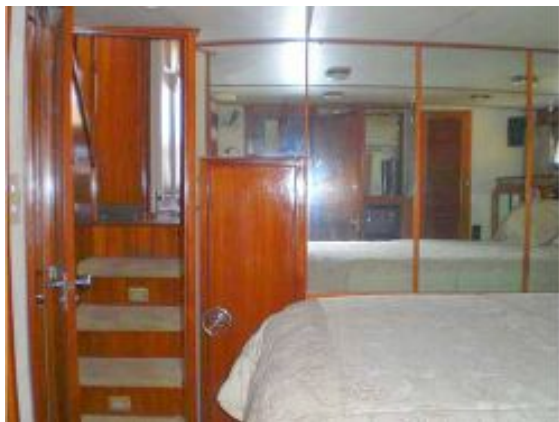
> 49' DeFever master stateroom aft