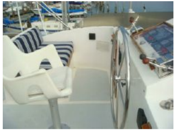
> 49' DeFever flybridge port