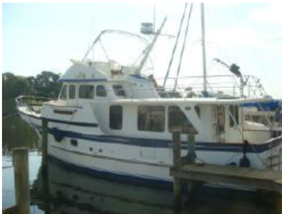
> 49' DeFever port aft profile