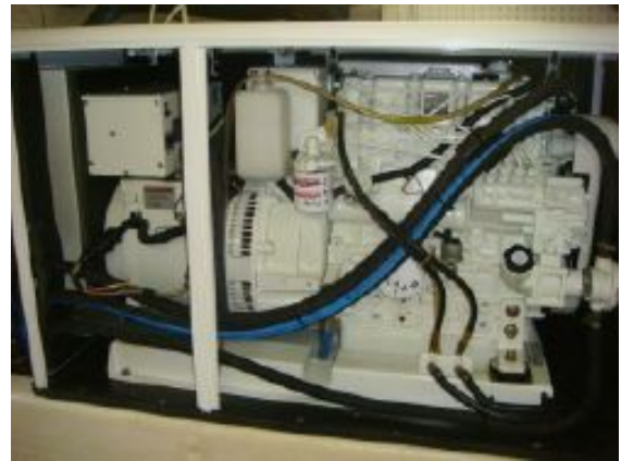
> 49' DeFever generator