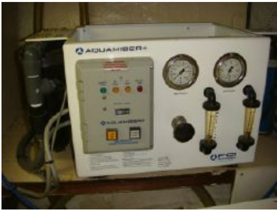
> 49' DeFever water maker