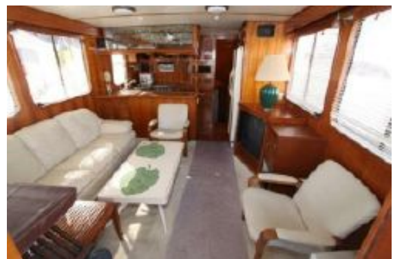
> 49' DeFever salon forward