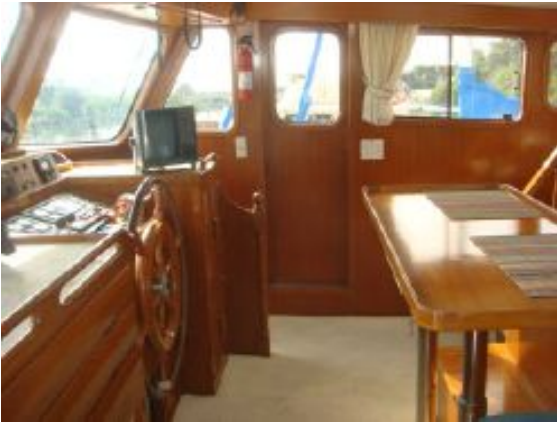
> 49' DeFever pilothouse starboard