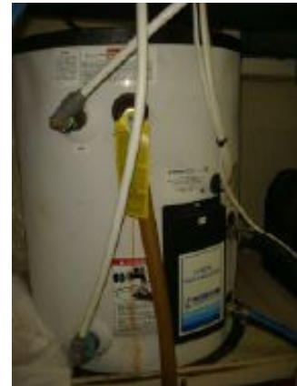
> 49' Defever water heater