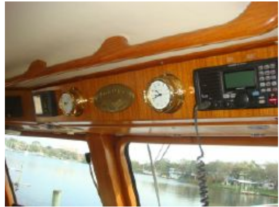
> 49' DeFever pilothouse overhead electronics