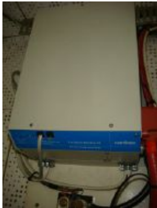
> 49' DeFever inverter/charger