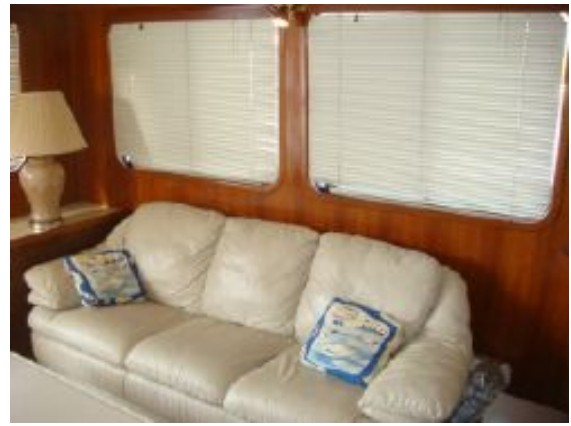
> 49' DeFever salon port