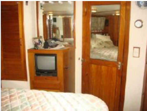
> 49' DeFever master stateroom forward