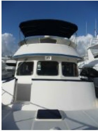
> 49' DeFever foredeck aft