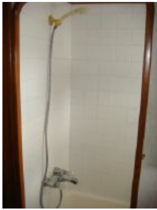
> 49' DeFever master stateroom shower