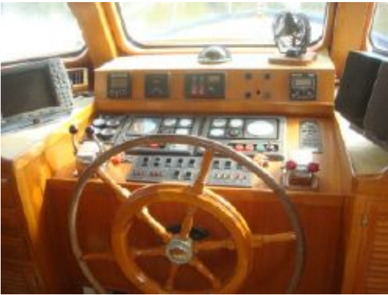
> 49' DeFever pilothouse helm