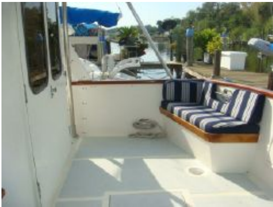
> 49' DeFever aftdeck starboard