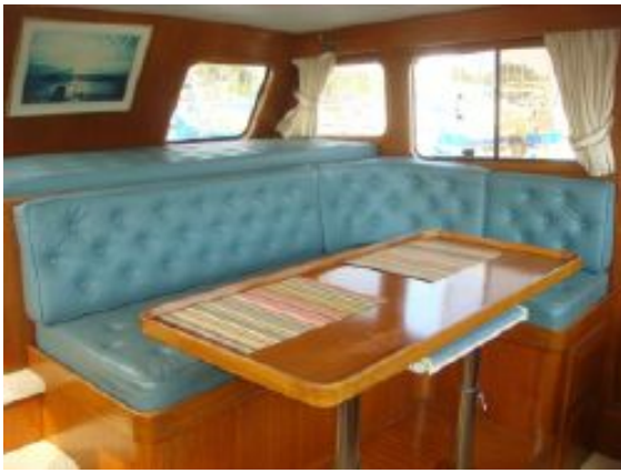
> 49' DeFever pilothouse seating