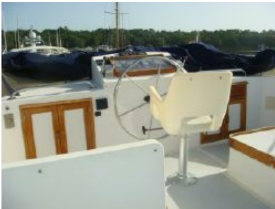
> 49' DeFever flybridge forward photo1