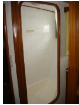
> 49' DeFever master stateroom tub