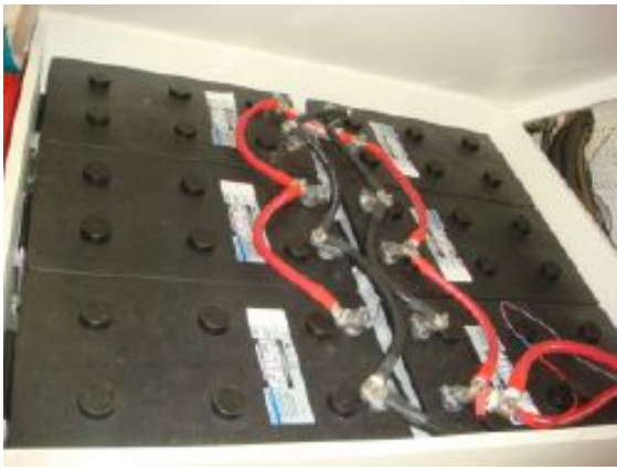
> 49' DeFever battery bank photo2