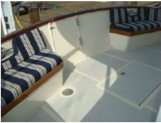
> 49' DeFever aftdeck