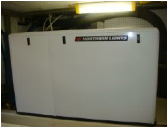
> 49' DeFever generator sound box