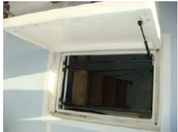
> 49' DeFever lazarette access