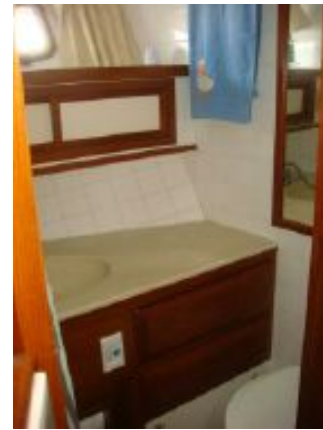
> 49' DeFever guest head