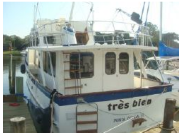
> 49' DeFever aft profile