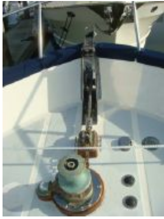
> 49' DeFever anchor windlass