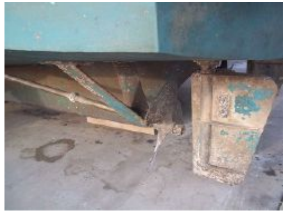
> 49' DeFever hauled out port running gear