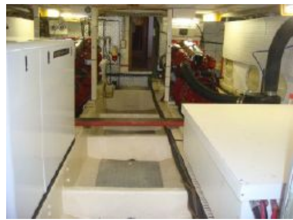
> 49' DeFever engine room forward