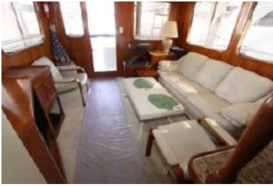
> 49' DeFever salon aft