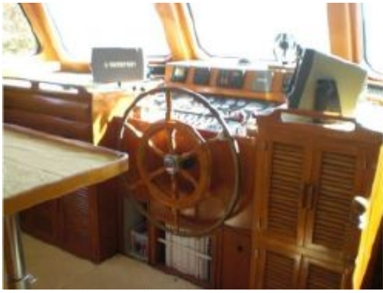
> 49' DeFever pilothouse forward