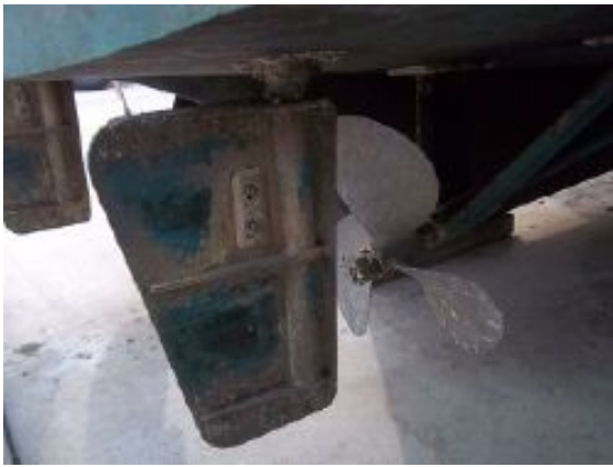
> 49' DeFever hauled out starboard running gear