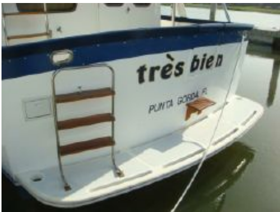
> 49' DeFever swimplatform