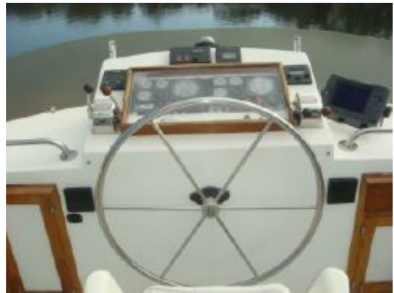
> 49' DeFever flybridge helm