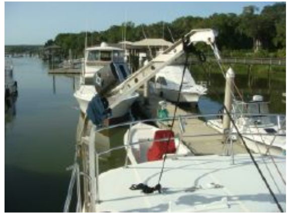
> 49' DeFever tender davit