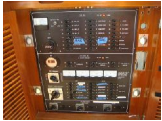
> 49' DeFever electrical panel