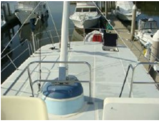
> 49' DeFever flybridge aft