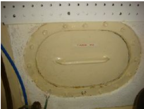
> 49' DeFever fuel tank access