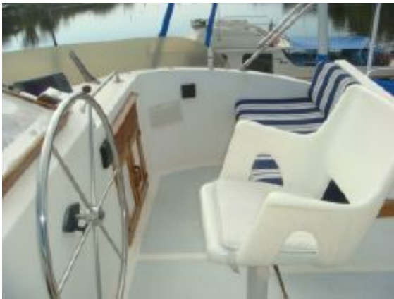
> 49' DeFever flybridge starboard