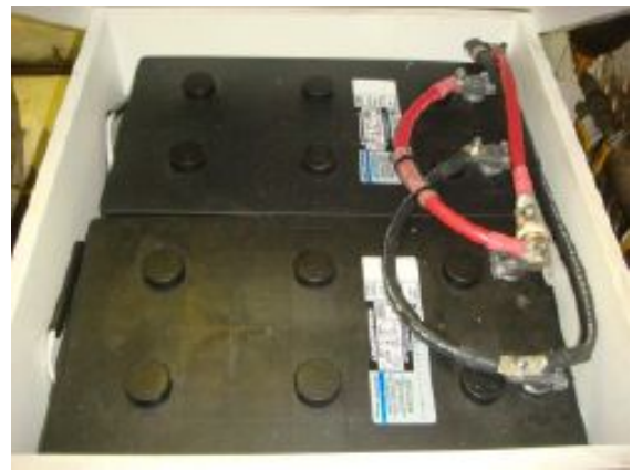
> 49' DeFever battery bank photo1