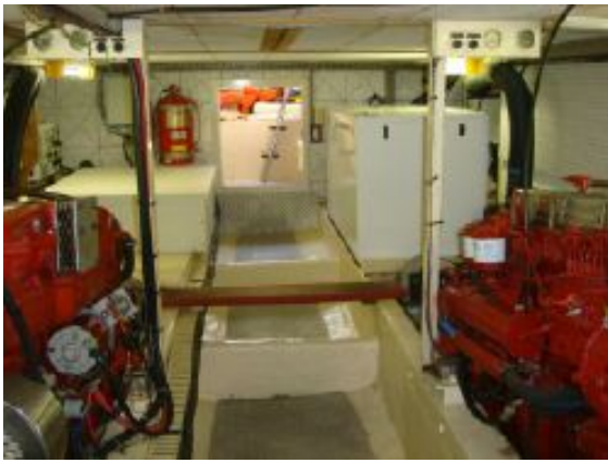
> 49' DeFever engine room aft