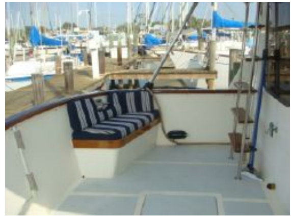
> 49' DeFever aftdeck port