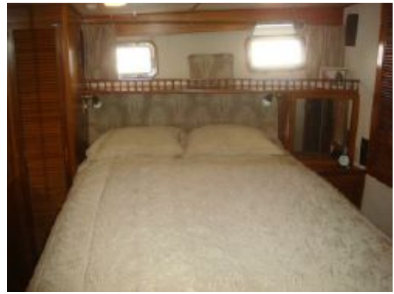
> 49' DeFever master stateroom