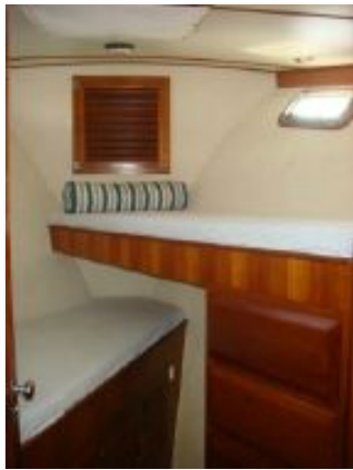
> 49' DeFever guest stateroom