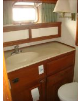
> 49' DeFever master stateroom head