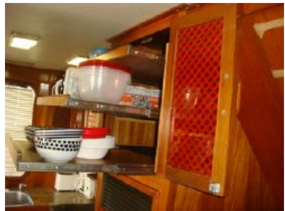
> 49' DeFever galley storage