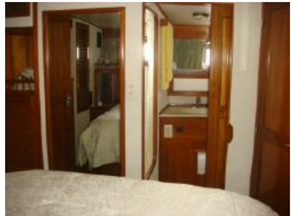
> 49' DeFever master stateroom starboard