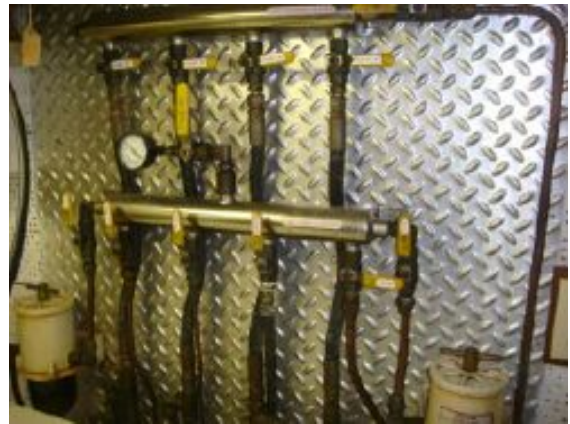
> 49' DeFever fuel manifold