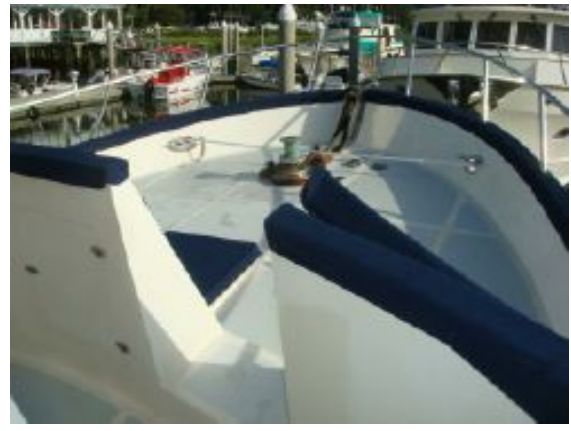
> 49' DeFever foredeck