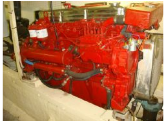
> 49' DeFever port main engine