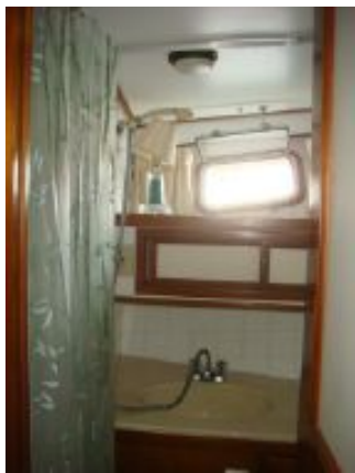
> 49' DeFever guest shower