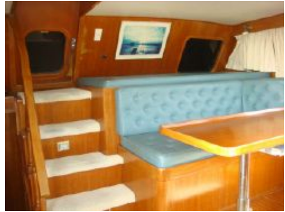
> 49' DeFever pilothouse aft