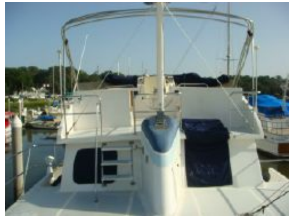
> 49' DeFever flybridge forward photo2