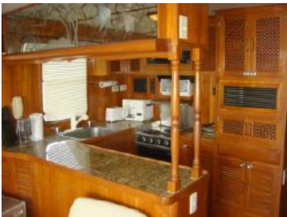
> 49' DeFever galley