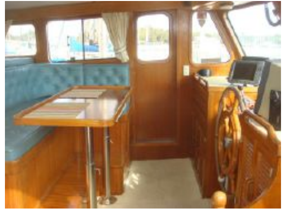
> 49' DeFever pilothouse port