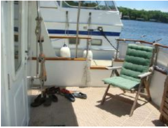
> 50' Trawler aftdeck starboard