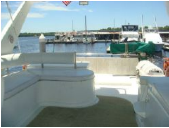
> 50' Trawler flybridge aft