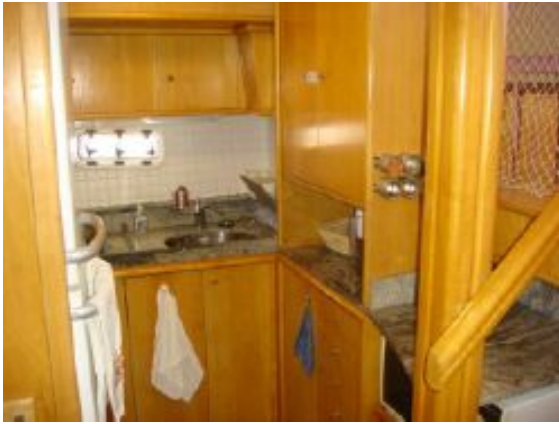
> 50' Trawler galley photo1