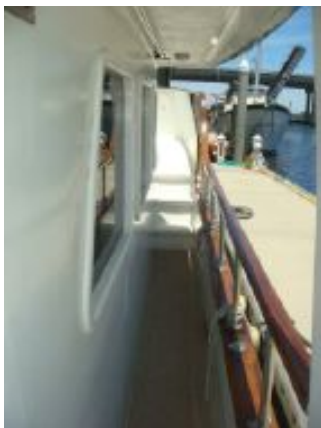
> 50' Trawler starboard side deck photo2