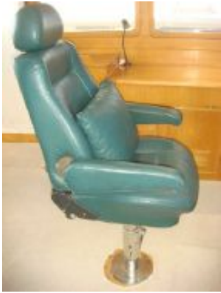
> 50' Trawler pilothouse helmseat