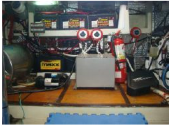
> 50' Trawler engine room aft