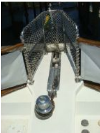
> 50' Trawler anchor windlass