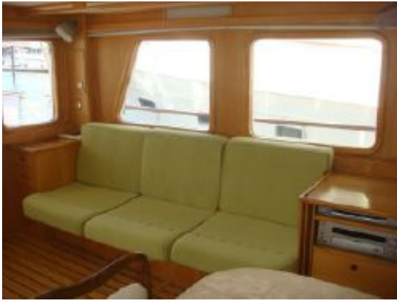
> 50' Trawler salon port