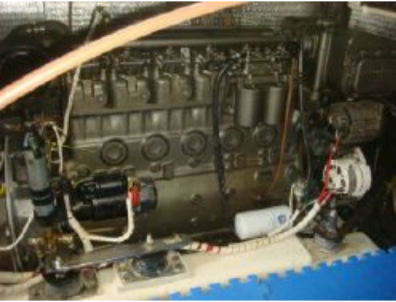
> 50' Trawler port main engine