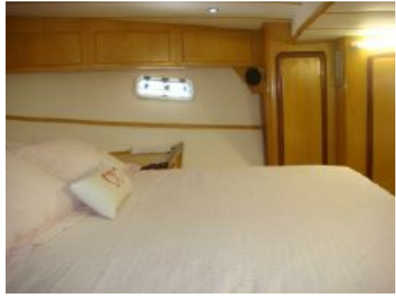
> 50' Trawler master stateroom starboard