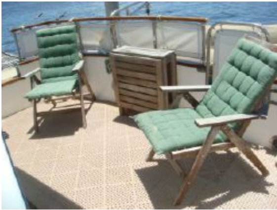
> 50' Trawler aftdeck