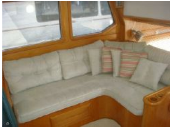
> 50' Trawler pilothouse seating photo1