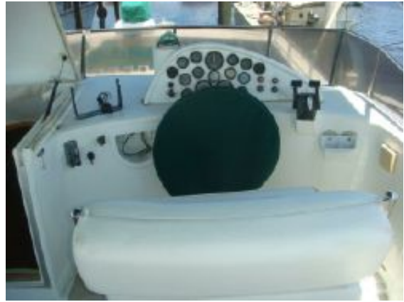
> 50' Trawler flybridge helm