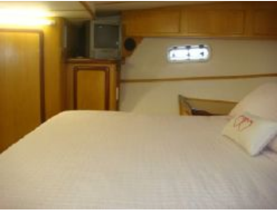
> 50' Trawler master stateroom port