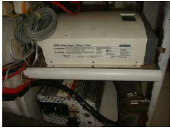
> 50' Trawler battery charger