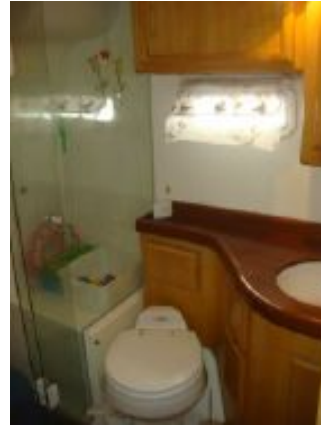
> 50' Trawler guest head