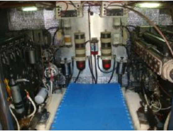
> 50' Trawler engine room forward