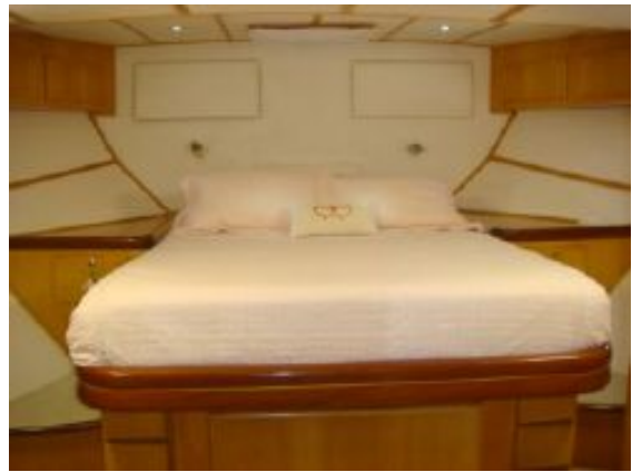
> 50' Trawler master stateroom