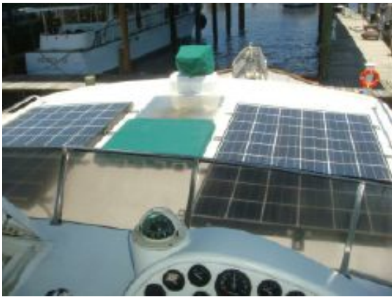
> 50' Trawler solar panels