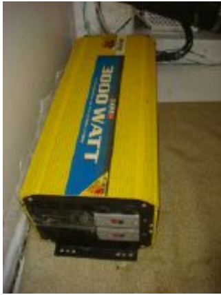
> 50' Trawler inverter