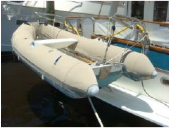
> 50' Trawler tender