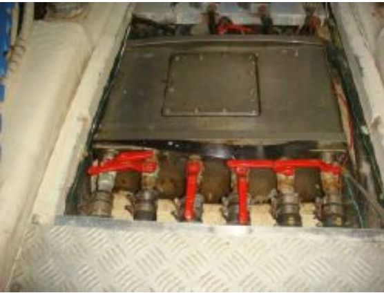
> 50' Trawler fuel manifold