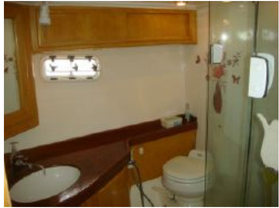
> 50' Trawler master stateroom head