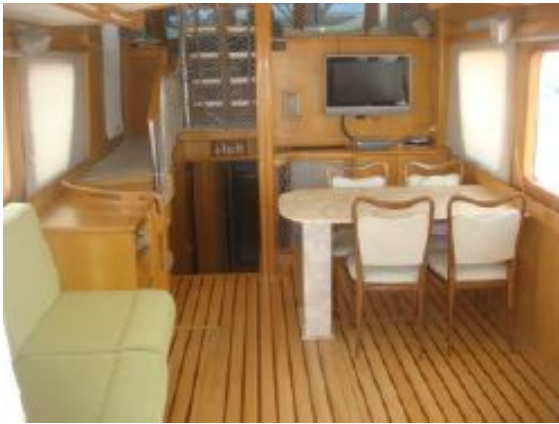
> 50' Trawler salon forward