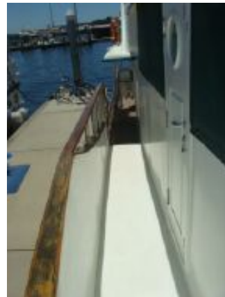
> 50' Trawler starboard side deck photo1