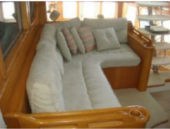
> 50' Trawler pilothouse seating photo2