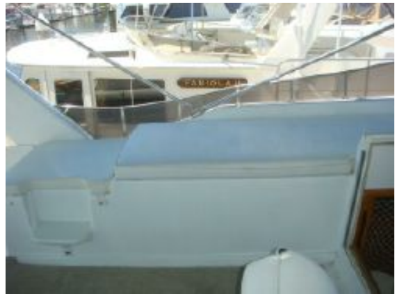
> 50' Trawler flybridge port