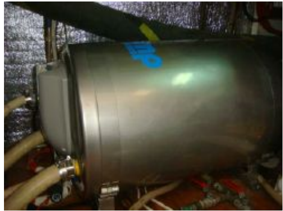
> 50' Trawler water heater