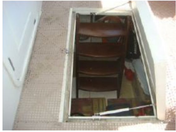
> 50' Trawler lazarette access