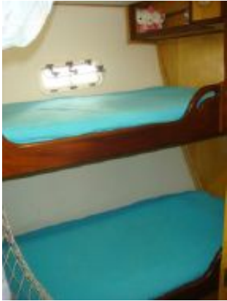
> 50' Trawler guest stateroom