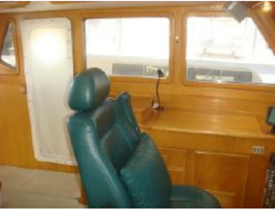
> 50' Trawler pilothouse port