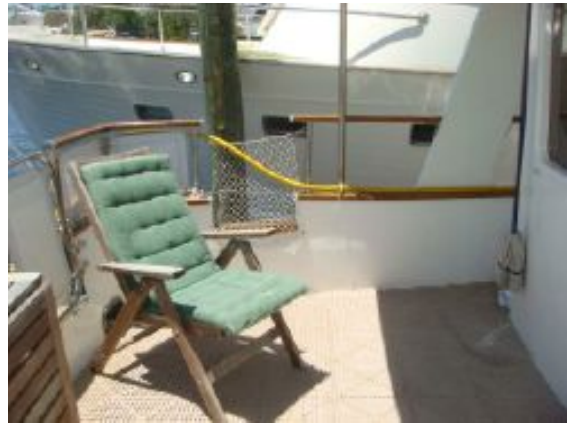
> 50' Trawler aftdeck port