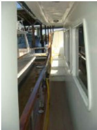
> 50' Trawler port side deck photo2