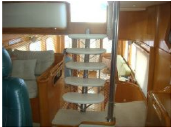
> 50' Trawler pilothouse aft