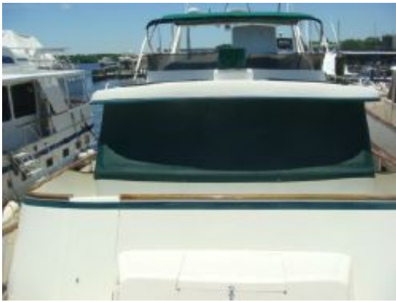
> 50' Trawler foredeck aft