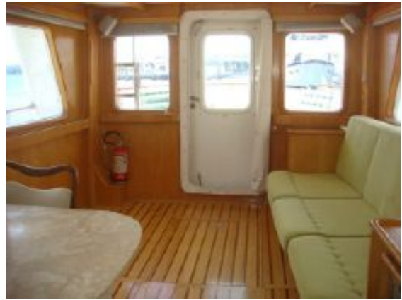
> 50' Trawler salon aft