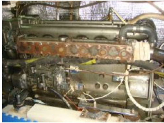
> 50' Trawler starboard main engine