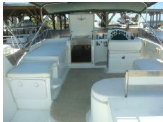
> 50' Trawler flybridge forward