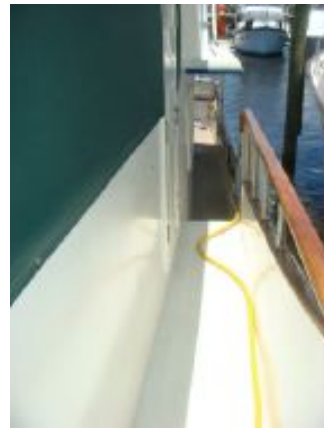
> 50' Trawler port side deck photo1