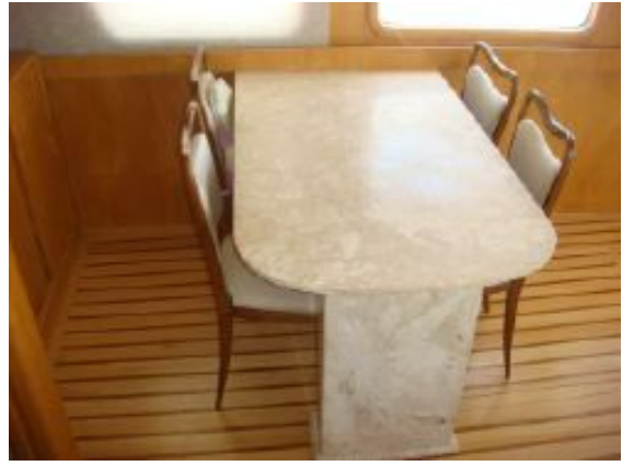
> 50' Trawler salon table