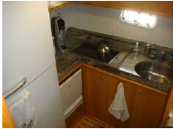
> 50' Trawler galley photo2