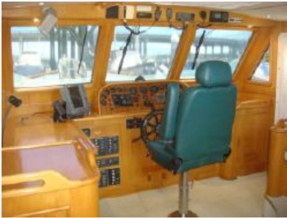
> 50' Trawler pilothouse forward