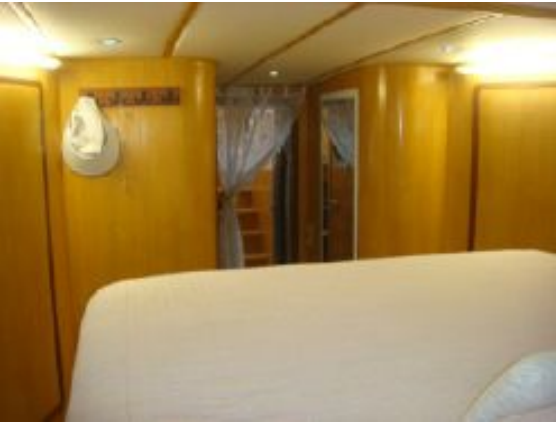
> 50' Trawler master stateroom aft