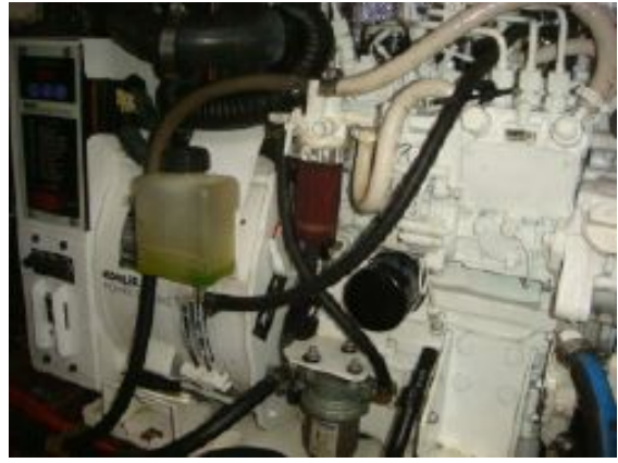
> 50' Trawler generator