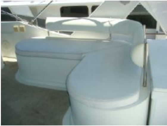
> 50' Trawler flybridge starboard