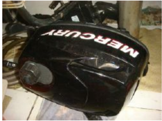
> 50' Trawler tender outboard