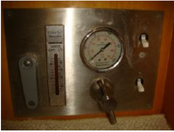
> 50' Trawler watermaker