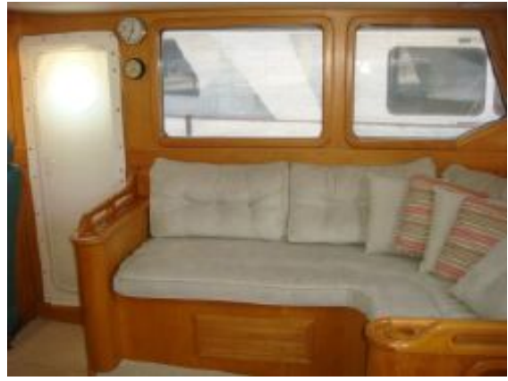
> 50' Trawler pilothouse starboard