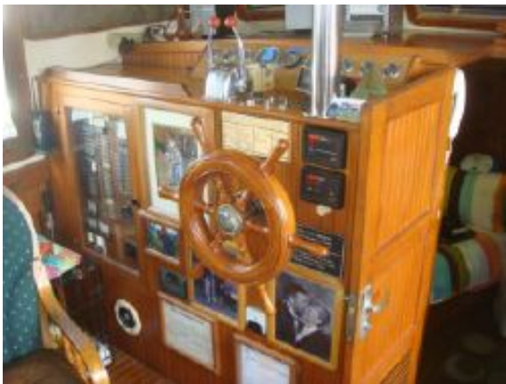
> 40' Ta Chiao lower helm