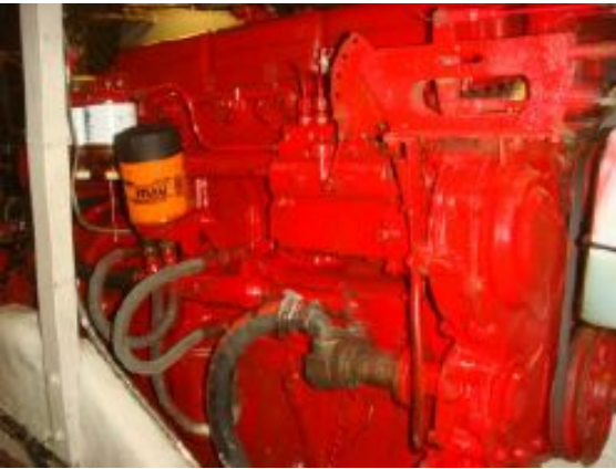
> 40' Ta Chiao port main engine