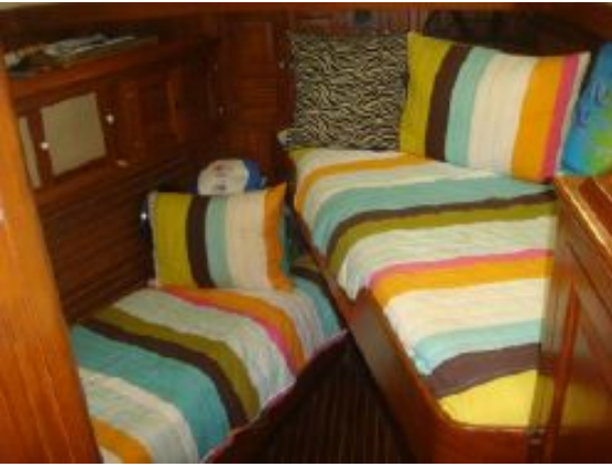
> 40' Ta Chiao guest stateroom