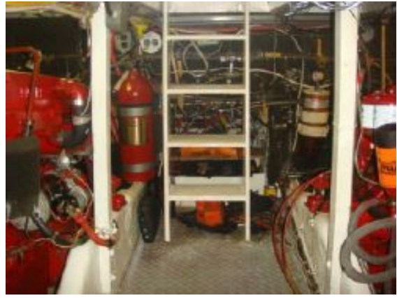
> 40' Ta Chiao engine room aft