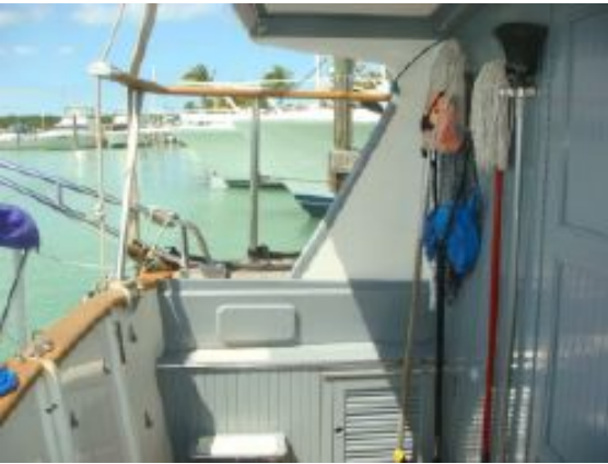
> 40' Ta Chiao cockpit port