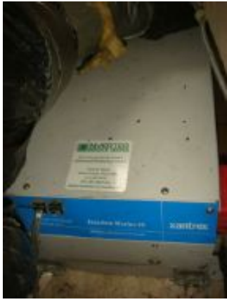
> 40' Ta Chiao inverter-charger