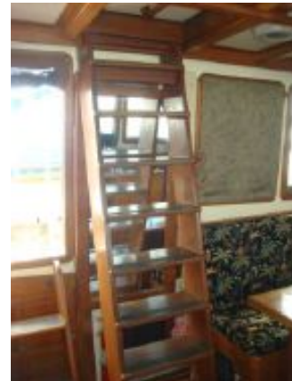
> 40' Ta Chiao interior flybridge ladder