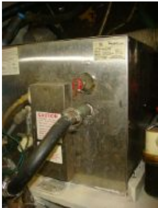
> 40' Ta Chiao water heater