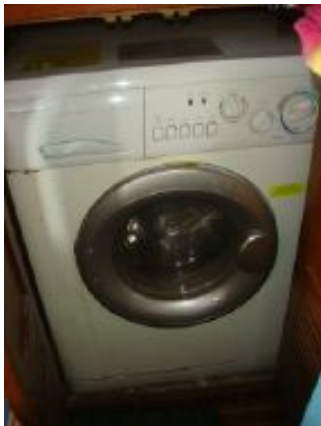
> 40' Ta Chiao washer-dryer