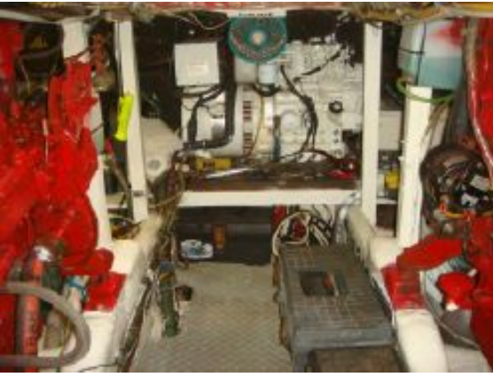
> 40' Ta Chiao engine room forward