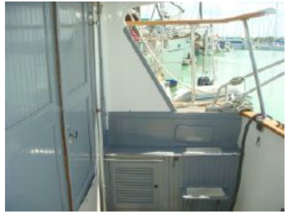
> 40' Ta Chiao cockpit starboard