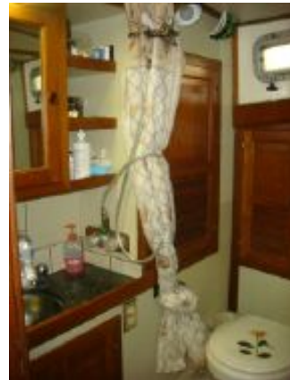
> 40' Ta Chiao guest stateroom head