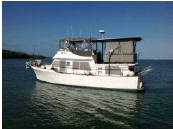
I Love Lucy