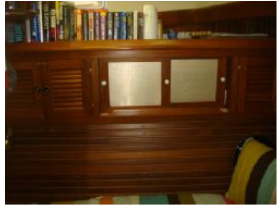
> 40' Ta Chiao guest stateroom port