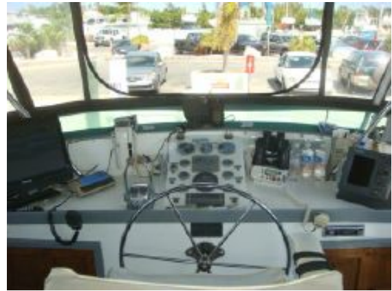
> 40' Ta Chiao flybridge helm