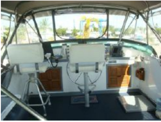
> 40' Ta Chiao flybridge forward