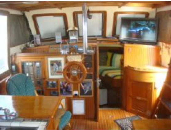
> 40' Ta Chiao salon forward