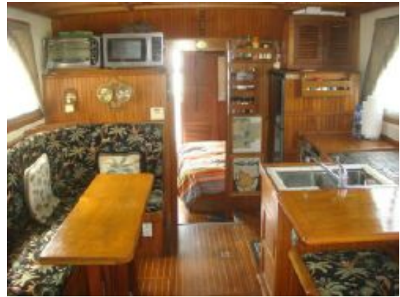
> 40' Ta Chiao salon aft