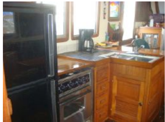
> 40' Ta Chiao galley photo3