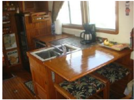
> 40' Ta Chiao galley photo1