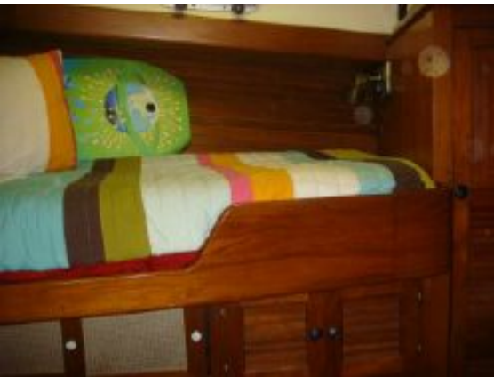
> 40' Ta Chiao guest stateroom starboard