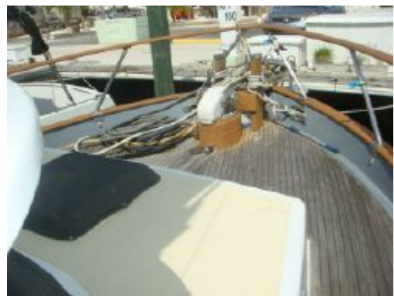
> 40' Ta Chiao foredeck