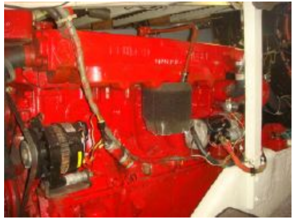
> 40' Ta Chiao starboard main engine