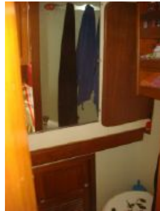
> 40' Ta Chiao master stateroom head photo2