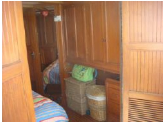
> 40' Ta Chiao master stateroom starboard