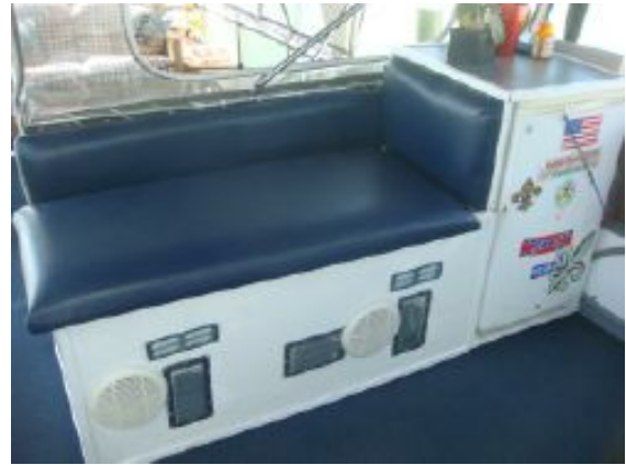
> 40' Ta Chiao flybridge aft seating