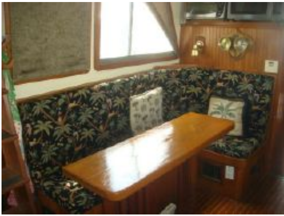
> 40' Ta Chiao salon seating