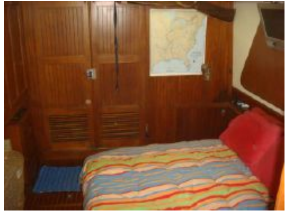
> 40' Ta Chiao master stateroom aft photo1