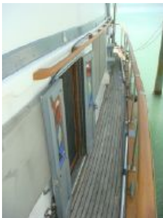
> 40' Ta Chiao port side deck