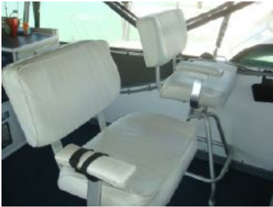
> 40' Ta Chiao flybridge helmseats