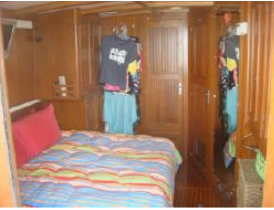
> 40' Ta Chiao master stateroom forward