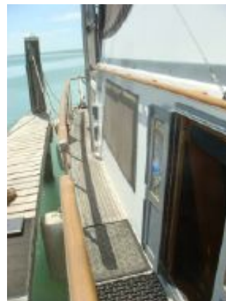
> 40' Ta Chiao starboard side deck