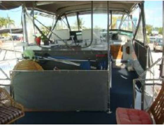
> 40' Ta Chiao sundeck forward