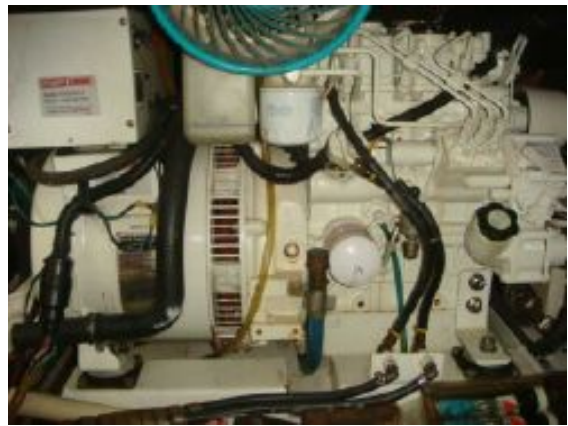
> 40' Ta Chiao generator