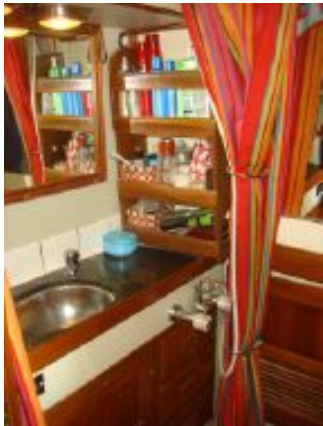
> 40' Ta Chiao master stateroom head photo1