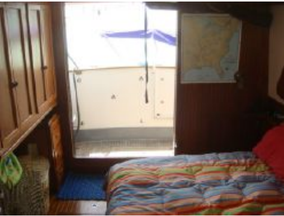
> 40' Ta Chiao master stateroom aft photo2