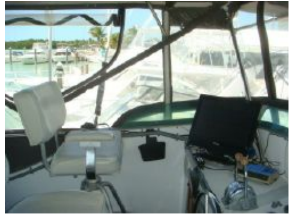
> 40' Ta Chiao flybridge port