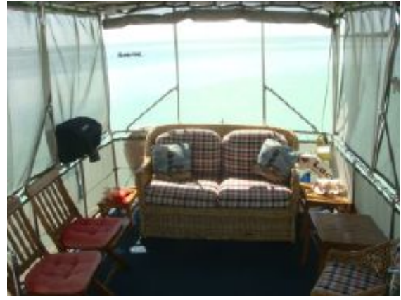
> 40' Ta Chiao sundeck aft