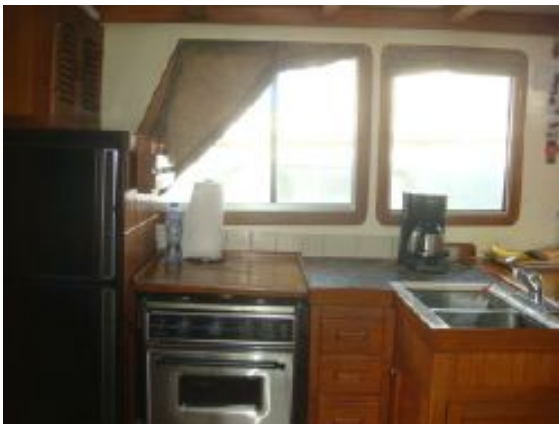
> 40' Ta Chiao galley photo2