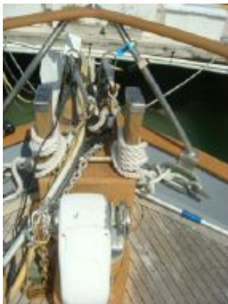
> 40' Ta Chiao anchor windlass