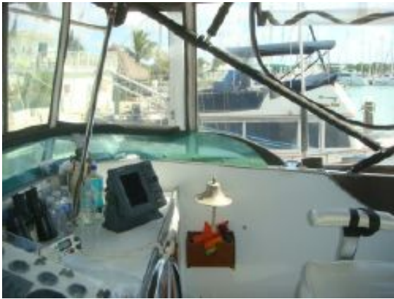
> 40' Ta Chiao flybridge starboard