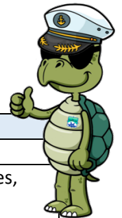
Capt Teri Pin